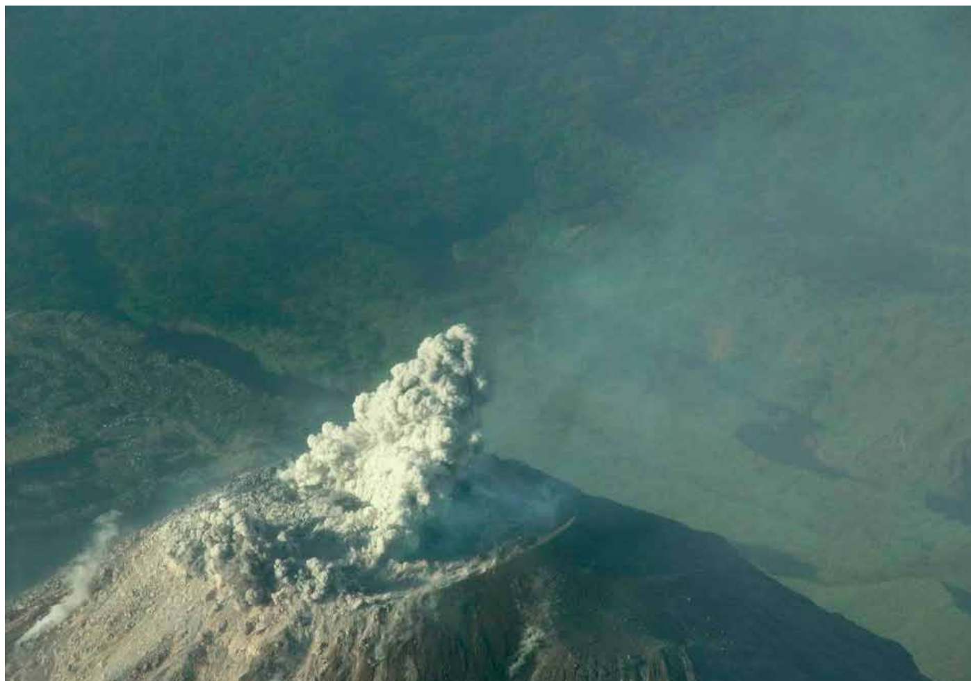
Volcano eruption at Santiaguito (Guatemala).

ERC Funding: €1.9 million for five years