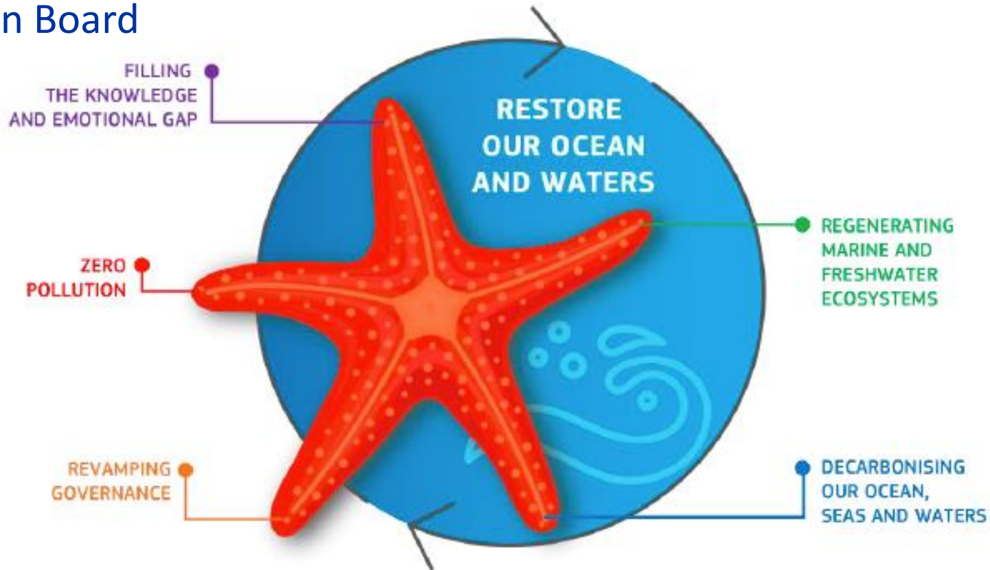
Figure 6. Mission Starfish 2030

This Mission implementation follows the Starfish report recommendations from previous Mission Board