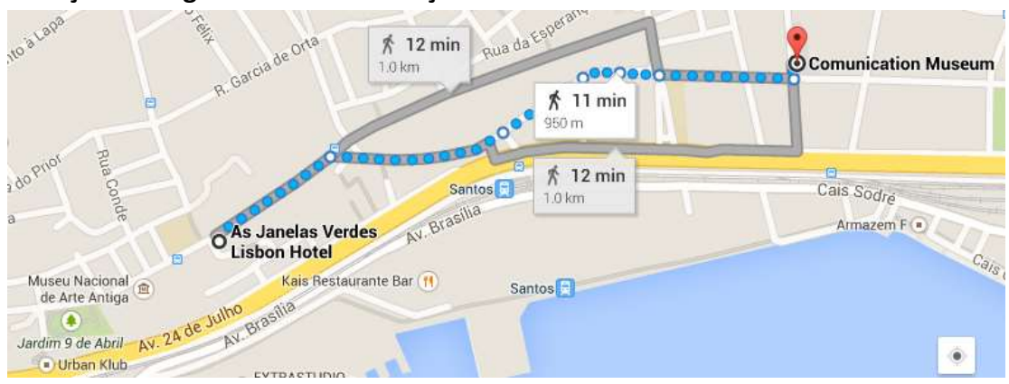
Exemple 2: Hotel Janelas Verdes > Venue in Fundação Portuguesa das Comunicações — Communications Museum

Note: a taxi from the airport it will cost about 15 to 20 eur.