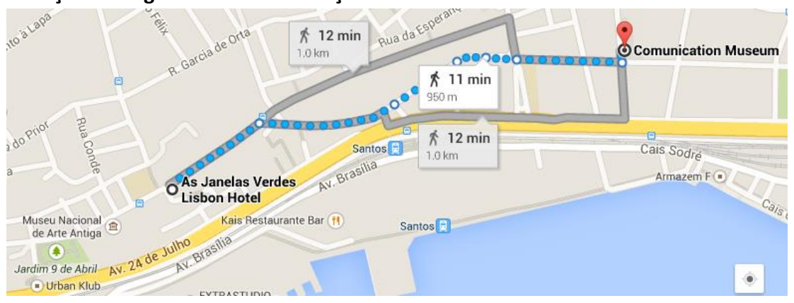
Exemple 2: Hotel Janelas Verdes > Venue in Fundação Portuguesa das Comunicações — Communications Museum

Note: a taxi from the airport it will cost about 15 to 20 eur.